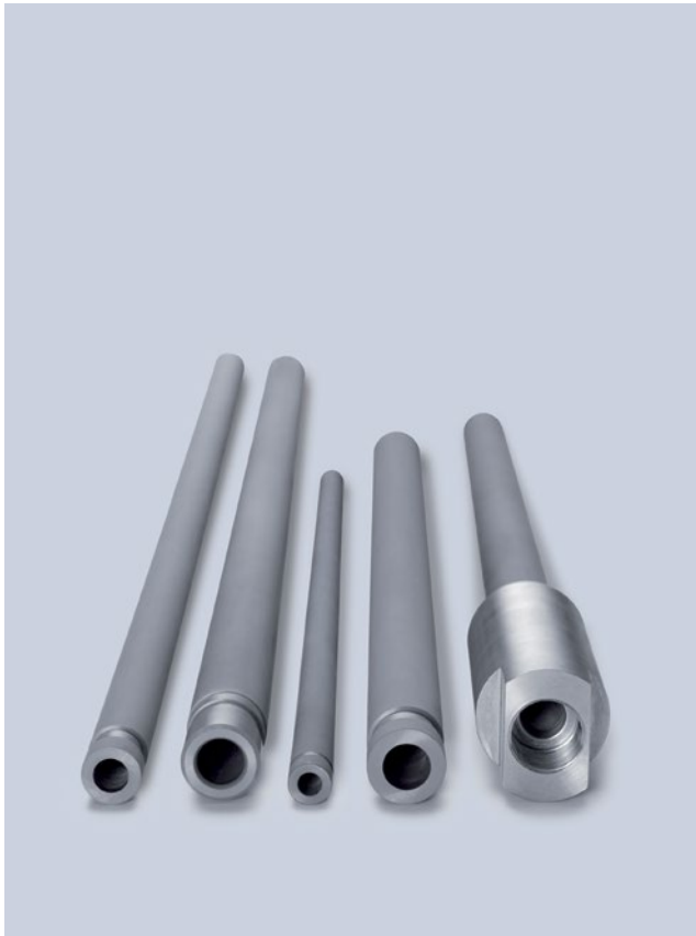
3M™ Silicon Nitride Thermocouple Protection Tubes in different designs

The most efficient material used for temperature measurement and control of aluminium and many non-ferrous alloys.